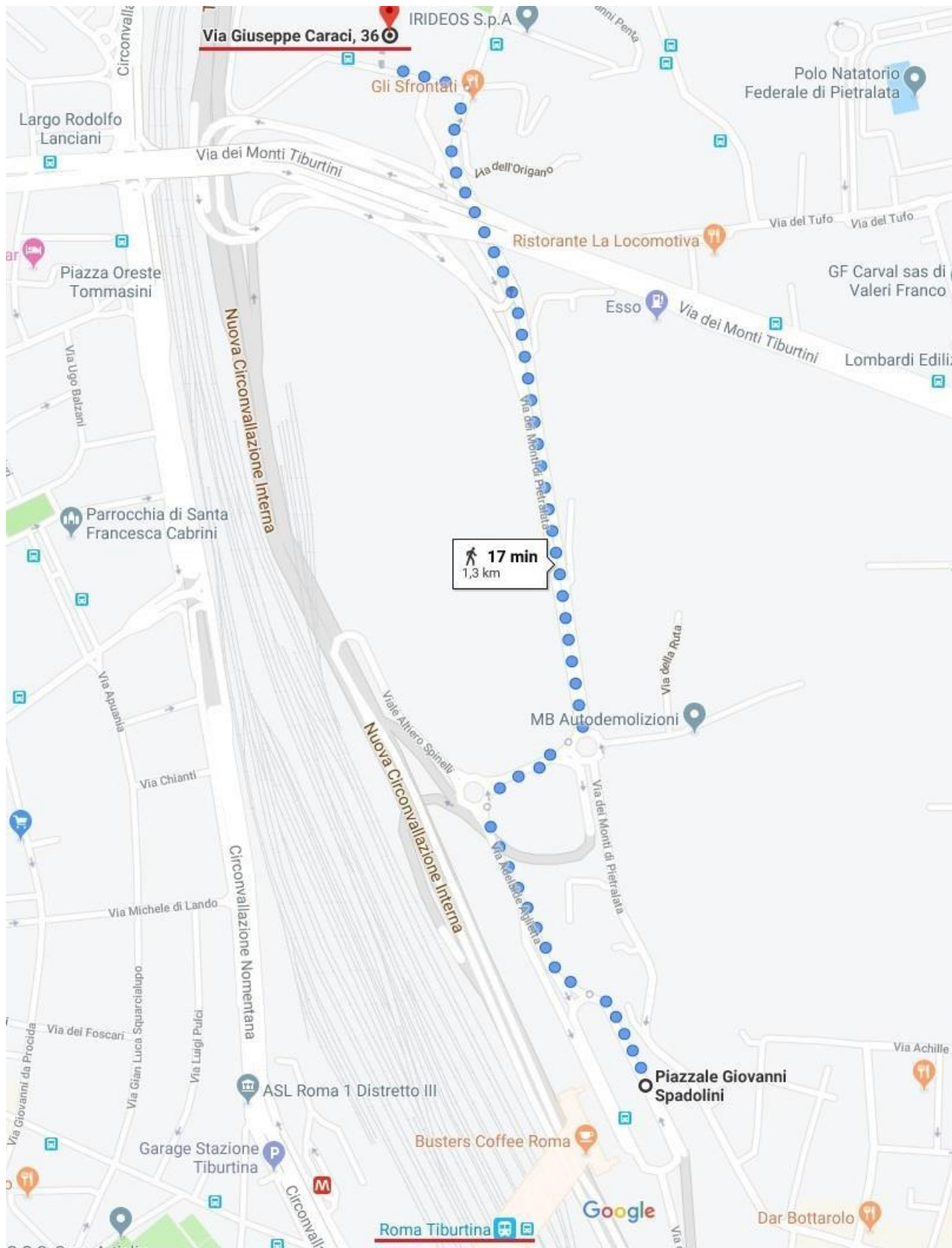
From Tiburtina station to Via Giuseppe Caraci by foot