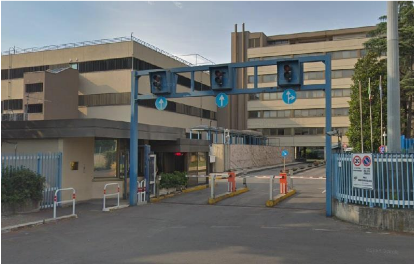
The Ministry entrance